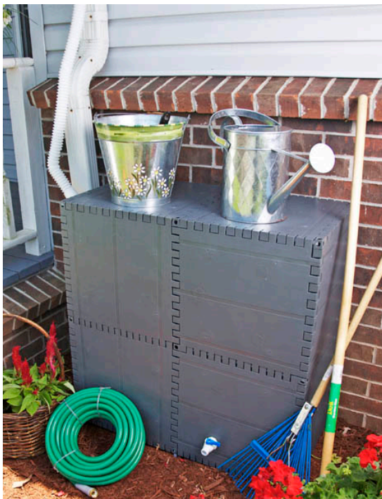
PHOTO: 100 Gallon Gray Rain Barrel with Diverter

This is the year to join the tens of thousands of area households that have already participated in the annual Madison Compost Bin and Rain Barrel event.